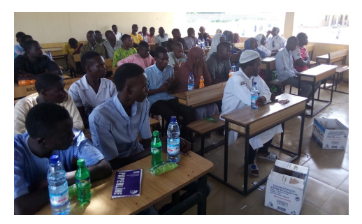
Youth groups at the peace and security training

The focus of the workshop was to raise awareness about programme objectives, which draw on global and national policy documents (such as the United Nations Security Council Resolution (UNSCR) 2250 on youth, peace and security; the Nigerian National Security Strategy and the