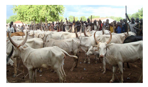
Cattle farm in Northern Nigeria