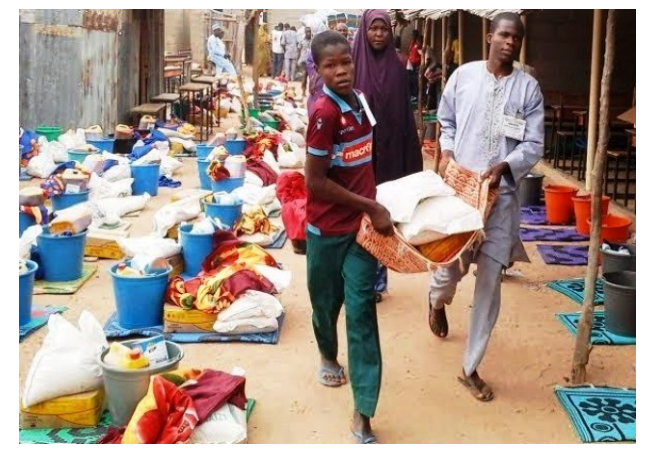
An IDP Camp, Borno State

Youth groups empowered to prevent violence