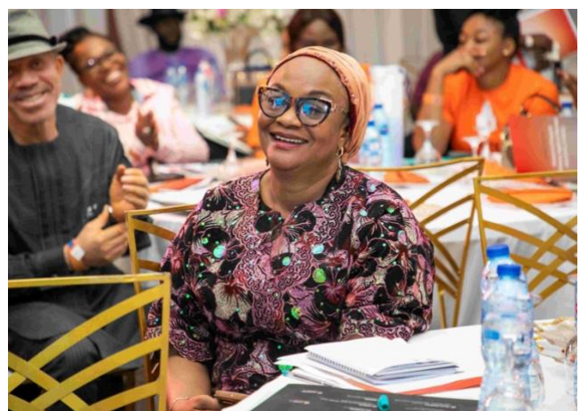
Participants at the National Dialogue.