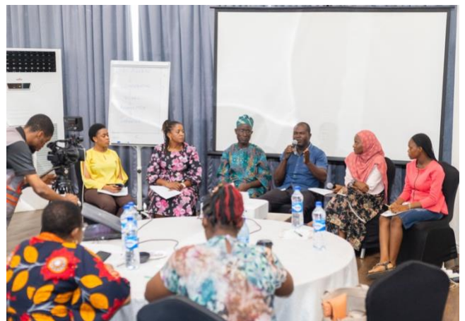
Stakeholders at the GBV sensitisation event in Lagos.