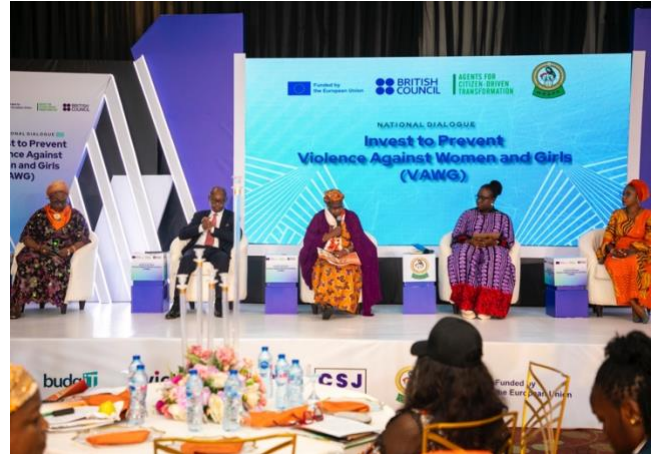
Participants at the National Dialogue.