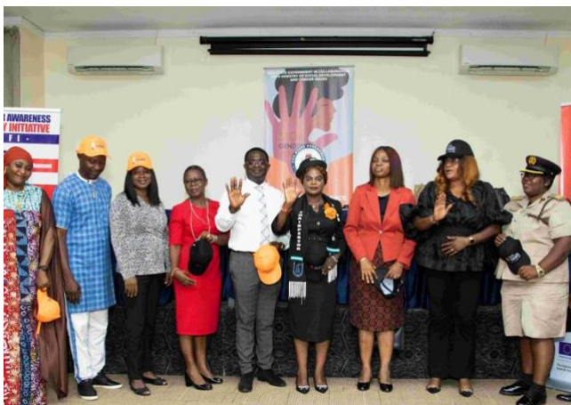
Stakeholders at policy think tank in Edo State.