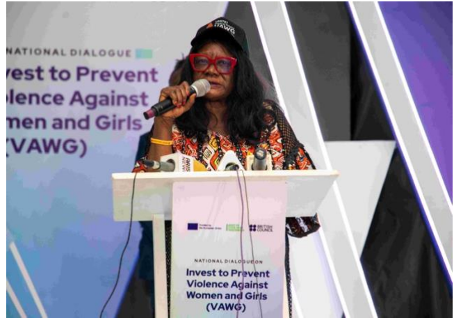
H.E. Josephine Piyo, Deputy Governor, Plateau State.

To commemorate the campaign in Nigeria, civil society organisations (CSOs) participated in a series of activities across the ACT programme states (Edo, Plateau, Lagos and Kano), culminating in a national policy conversation with key stakeholders in the Federal Capital Territory (FCT). These activities were supported by the ACT programme over the campaign period from 25 November-7 December 2023.