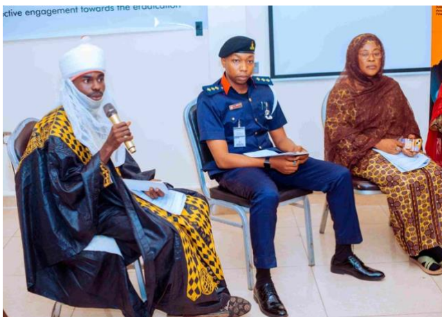
Stakeholders at an advocacy event in Kano.